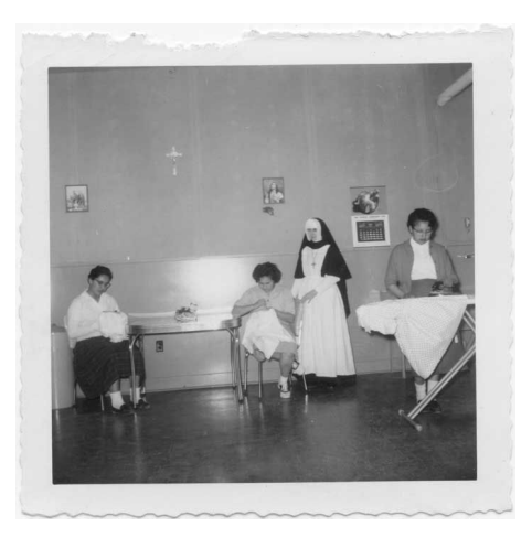
St. Mary's Indian Residential School http://archives.algomau.ca/main/book/ export/html/24019

Runaways were subject to punishment and humiliations. One principal tied the hands of a group of runaway boys together and made them run behind his buggy back to the school. In other cases, runaways were shackled to their beds at night.